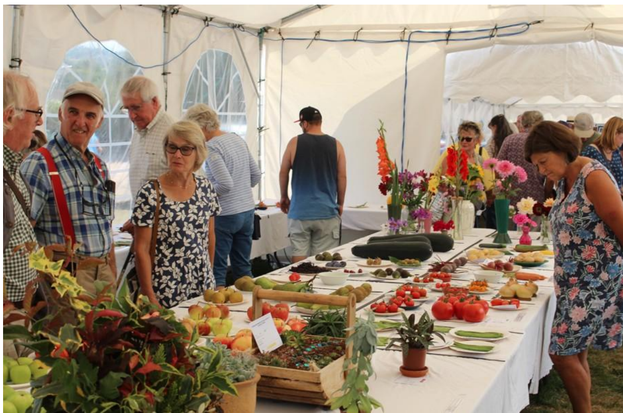
The Annual Show put on by our Horticultural Society was a great success, with several hundred people supporting the event, and the accompanying Car Boot Sale.