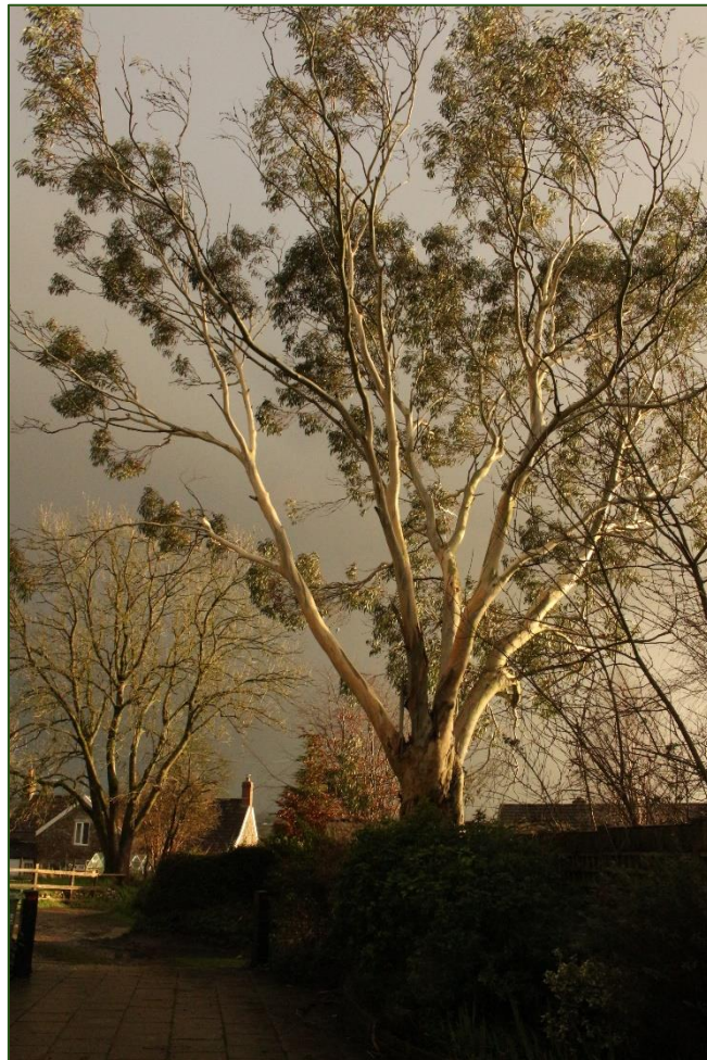
A break in the storm- Photographed last week by me! . The adjacent tree in the background can be found on the Home Page of the Parish Web site