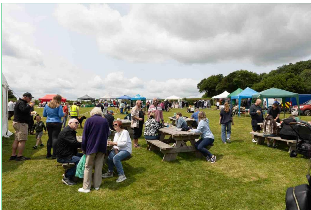
The Winsham Dog Show and Craft Fair was blessed with good weather and proved to be very popular.