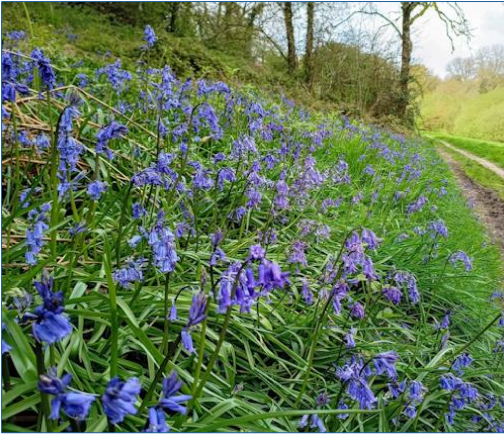
Masses of Bluebells at Burr ridge Common

For the less energetic, there is also a lot to look forward to; on Thursday 17 th (this coming Thursday) there is the Jubilee Café, with lots of lovely cakes. If you are worried about putting on weight, you can console yourself with the thought that if you go on the next Winsham Walkers walk (which has a theme associated with the Street Fair) you will soon burn off those extra calories!